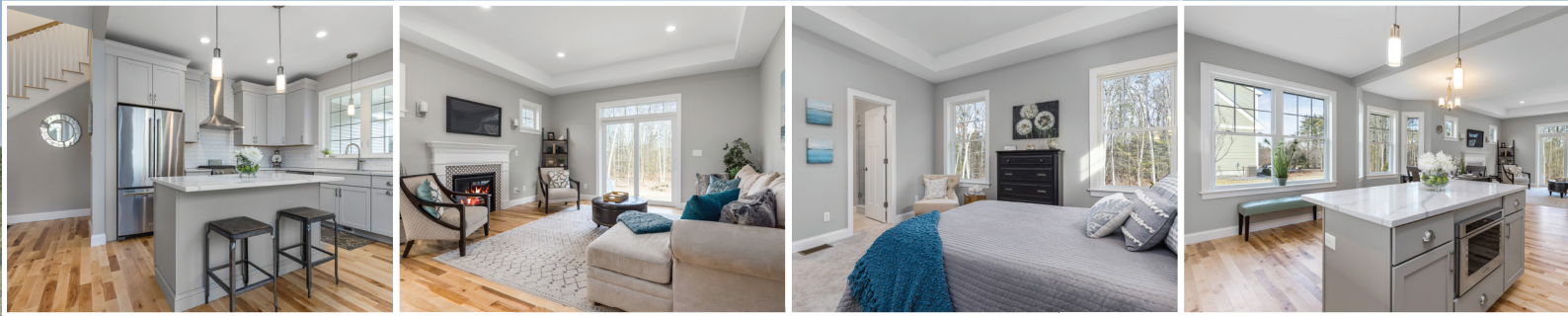
Similar Homes Built by Chinburg Properties

Summit Circle is built by multi-year EPA Partner of the Year Sustained Excellence winner Chinburg Properties, offering unmatched energy efficiency and a personal, hands-on building experience. Every Chinburg home comes with Energy Star Certification, a lifetime homeowner hotline, and a home automation system. Customize your bespoke interior selections at the Chinburg Design Center, conveniently located in downtown Newmarket.